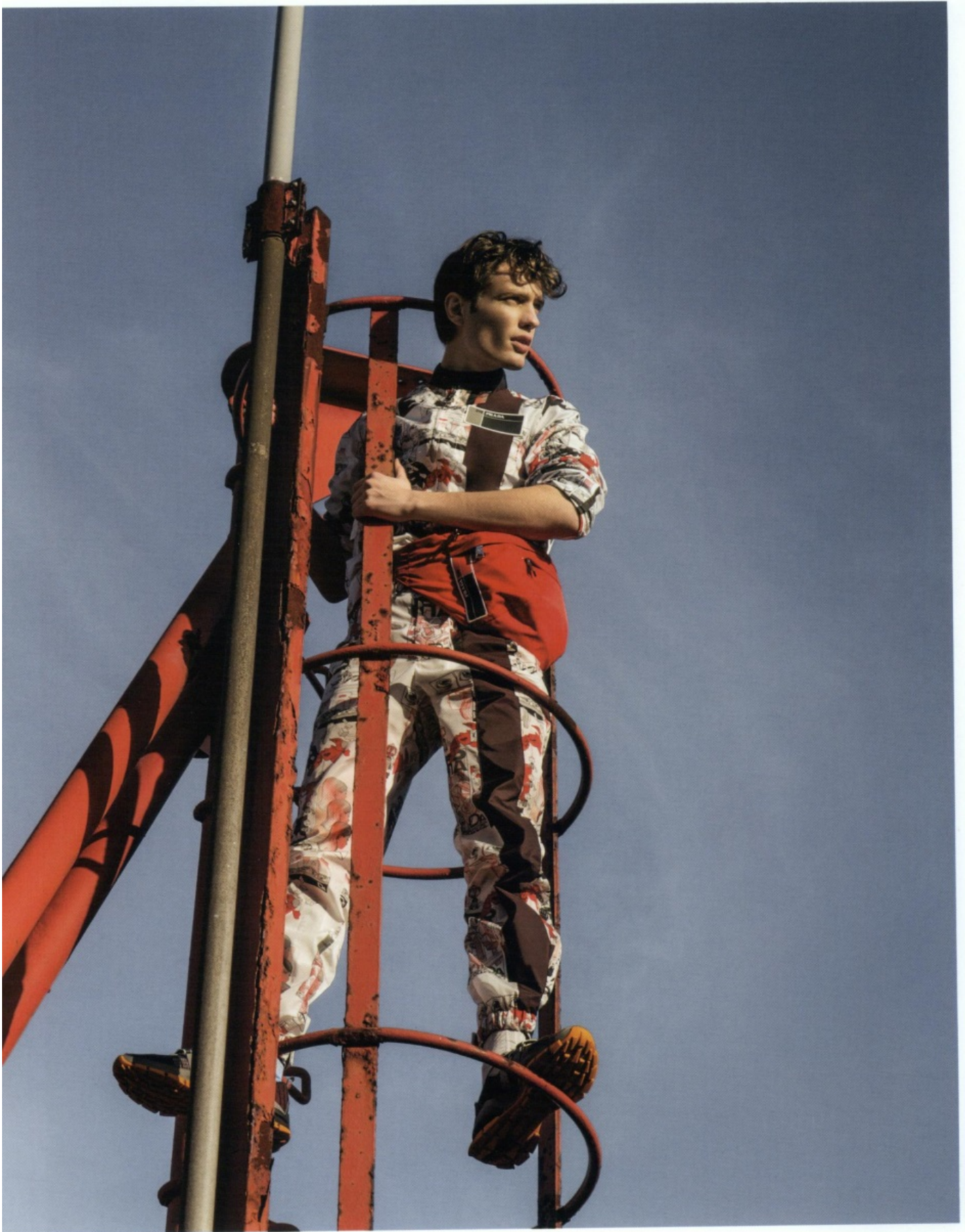
EMIRATI ARABI - ADAM & EVE - PRADA - 01.01.18