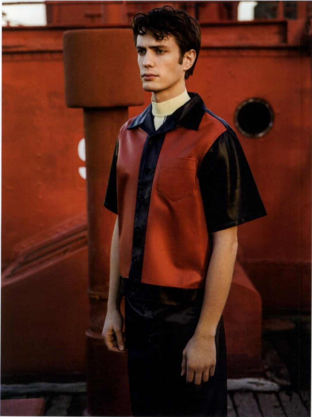
BICOLOUR NAPPA LEATHER SHIRT GABARDINE NYLON PANTS TECHNICAL COTTON KNITWEAR ALL BY PRADA